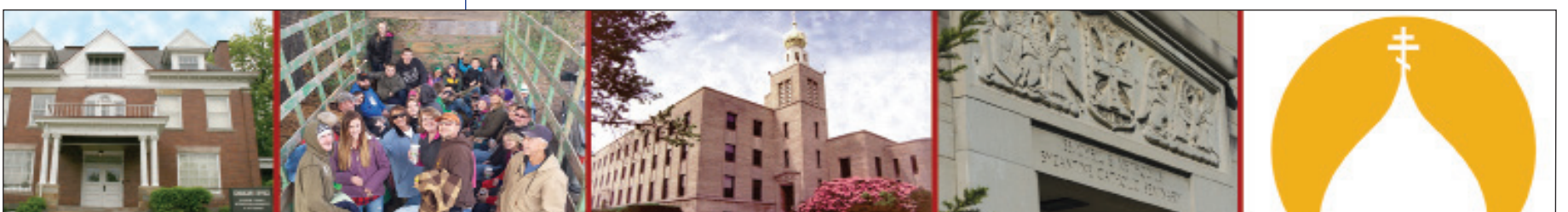
Central Archeparchial Administration Fund pages 15 to 18