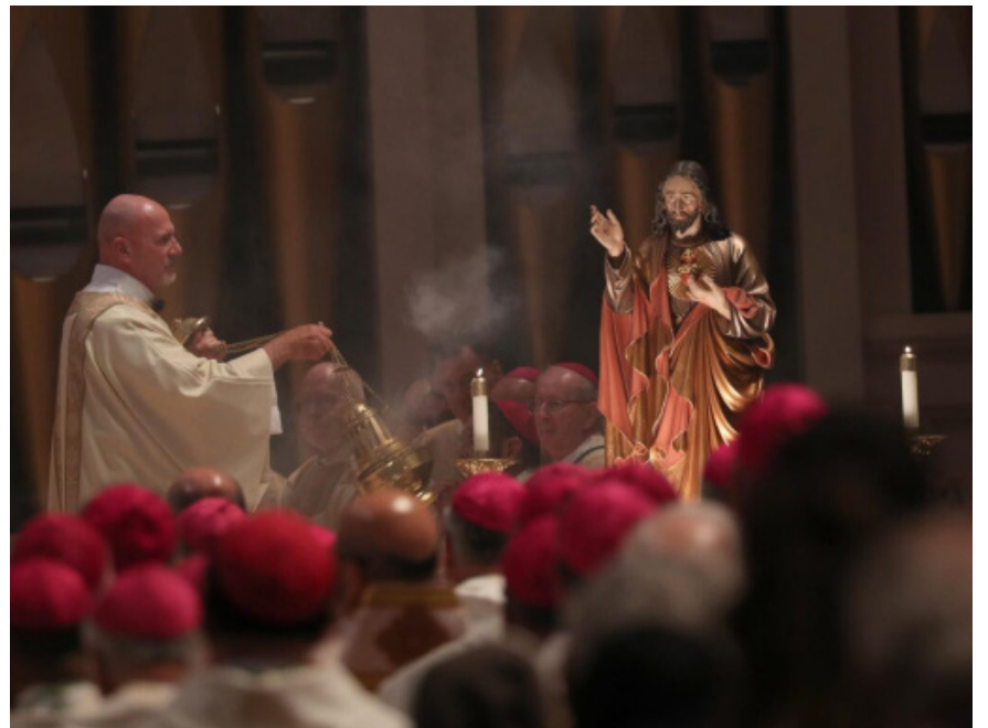
A clergyman swings a censer near a statue of the Sacred Heart of Jesus as U.S. Catholic bishops consecrate the country to the Sacred Heart at the Basilica of Mary Queen of the Universe in Orlando, Fla., June 11, 2026, during their spring plenary assembly.