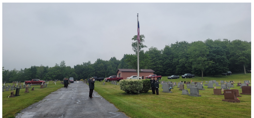
Windber VFW Post 4795 carries out 21 Gun Salute followed by double echo Taps.