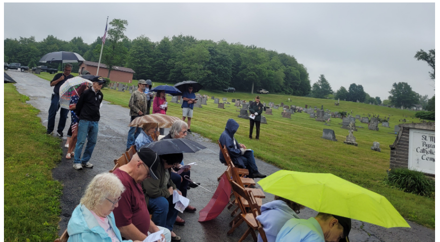
Veterans, Parishioners and Windber community members gather in prayer at Veterans Memorial Service.

As the ceremony closed, many convened at St. Mary's church hall for fellowship and reflection. ■